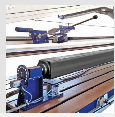
Pneumatically operated workpiece clamping and turning device mounted on the machine table.