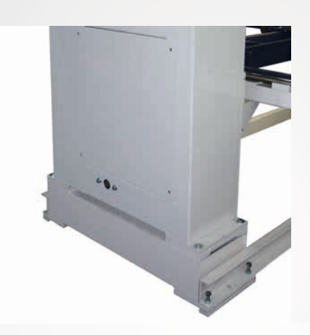
Base to increase the working height.