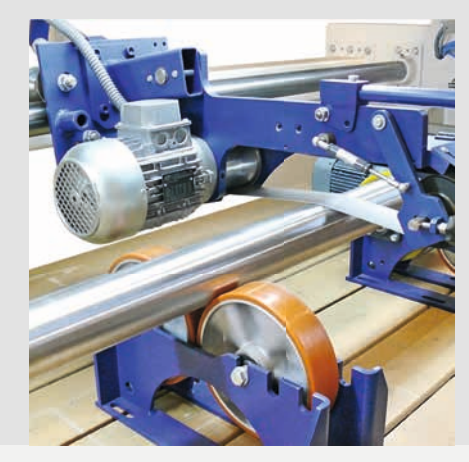
Tube grinding assembly consisting of a lateral grinding belt, with drive and idle rollers.