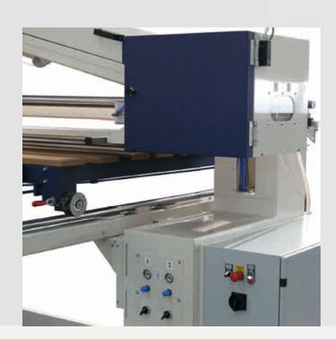
Machine stand with higher offset.

The basic machine body or the table guide can also be modified on request.