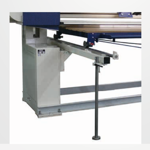
Supports for table guide rails for table loads up to 400 daN.

All illustrations may show special accessories which are available at extra cost.