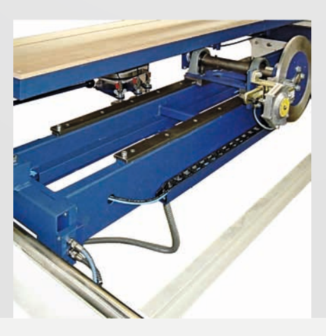
3D handling unit can be moved on guides from the centre to the right side of the table.