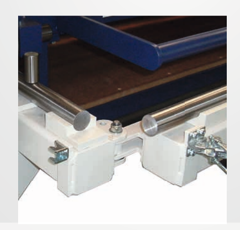
Retractable table guide rails.