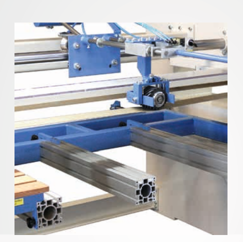
Aluminium cantilever arms to hold box-shaped workpieces.