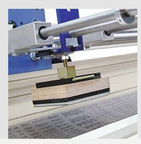
Grinding pad with ball-type quick fastener.

In addition to the basic equipment, we also offer practical accessories for individual applications.